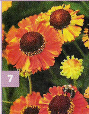
-Blooms of Bressingham