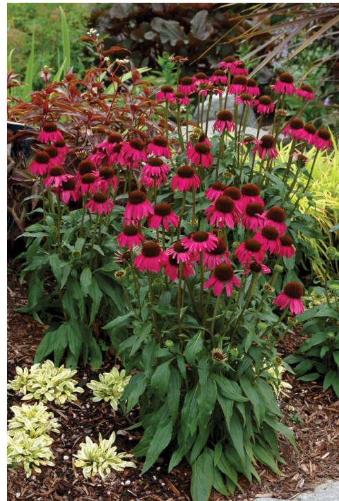
Echinacea 'Raspberry Tart'