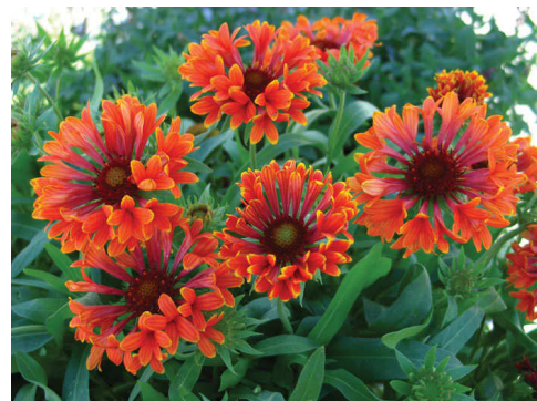
Gallardia 'Commotion Tlizzy'