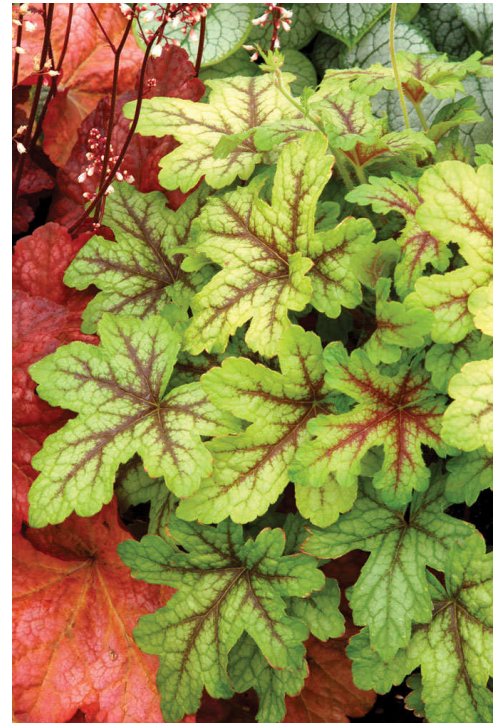
Heucherella 'Alabama Sunrise'

Add a touch of gold to the shade garden with this new box honeysuckle. Equally at home in the perennial garden or used as a specimen to infuse an area with color, 'Edmee Gold' throws layer after layer of golden branches with tiny, delicate leaves. "This shrub is so adaptable that it also can be used as a tall groundcover under large trees," says Guy. "It makes a very attractive addition to the winter garden with its bony, architectural silhouette." This native of China reaches four feet tall and wide in eight to 10 years.