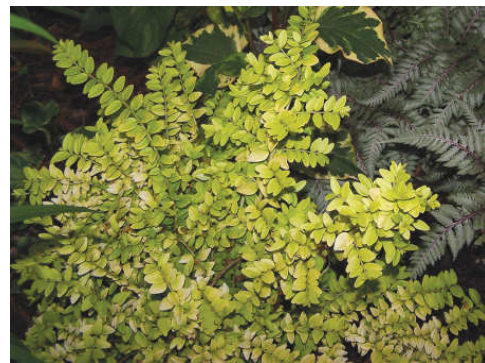
Lonicera nitida 'Edmee Gold'