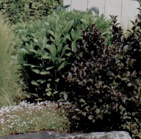
This photograph shows an easy, attractive butterfly and bird garden that also includes plants of different shapes and textures.