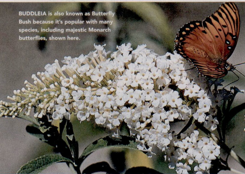
BUDDLEIA PETITE SNOW MICORROVA GROWERS

BUDDLEIA is also known as Butterfly Bush because it's popular with many species, including majestic Monarch butterflies, shown here.