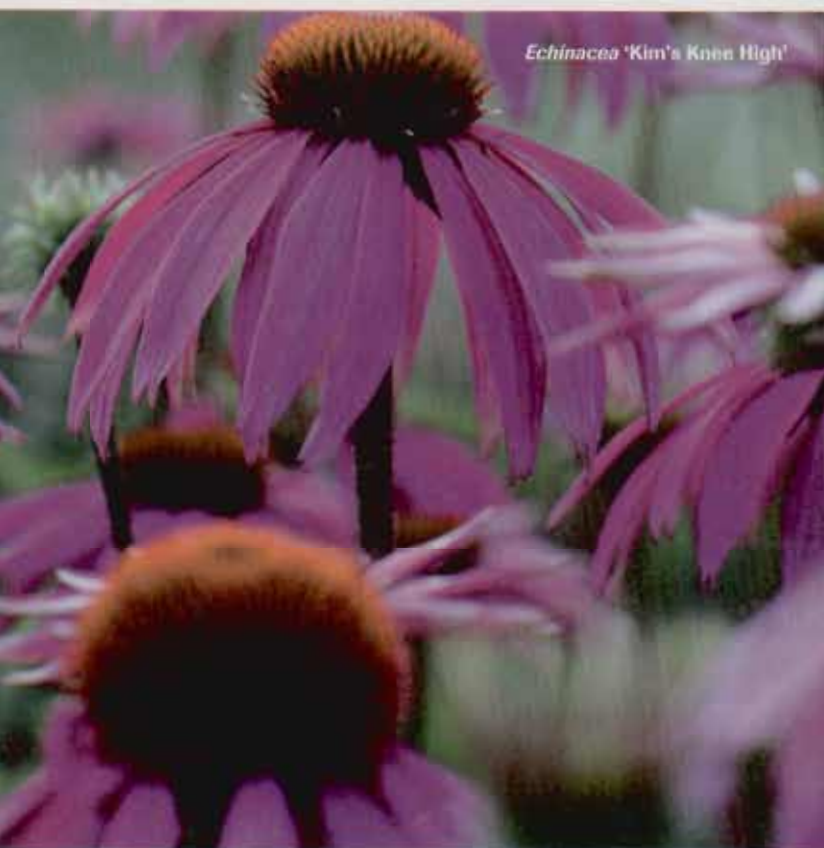
Echinacea 'Kim's Knee High'