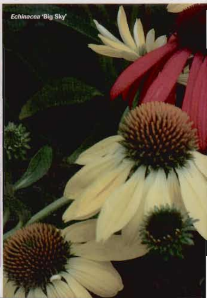
Echinacea 'Big Sky'