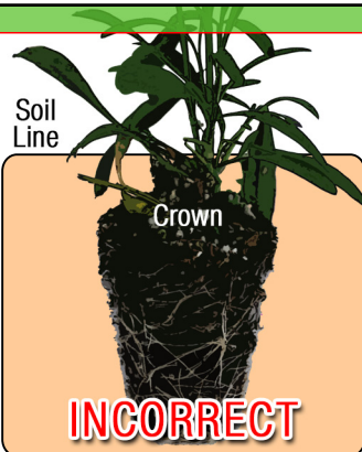
Do NOT bury the crown of the plug